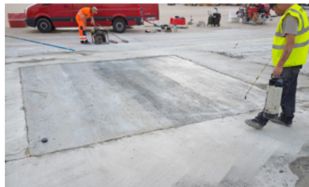
Applying curing compound