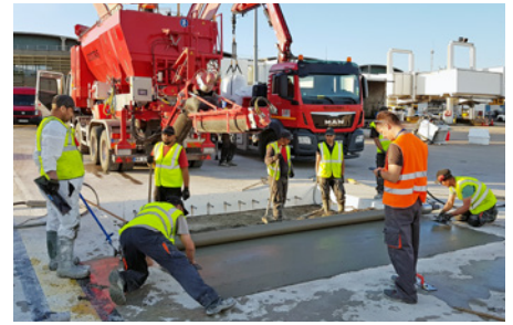
Concrete production on-site using a volumetric mobile concrete mixing truck, placing concrete, compacting concrete with vibrators