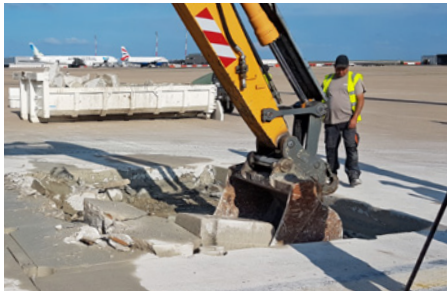
Breaking out existing slabs and removing old concrete