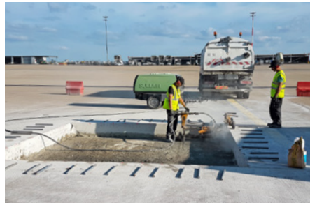
Preparing site and drilling dowelbars