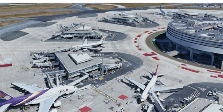
■ Damaged spots/areas in the apron/stands area

The site is being prepared for casting after breaking out and removing the old concrete slab. Concretum® Q-FLASH 2/20 is being produced on-site using a volumetric mobile mixing truck. The machine is fully loaded with cement, aggregates, water, and admixtures, having a capacity of approximately 9 m 3 of fresh concrete. While producing concrete, the truck can be reloaded with cement and aggregates by an automated reloading system.