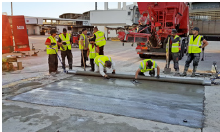
Finishing surface with roller screed and applying broom finish