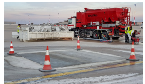
Cleaning site and hand over to air traffic control